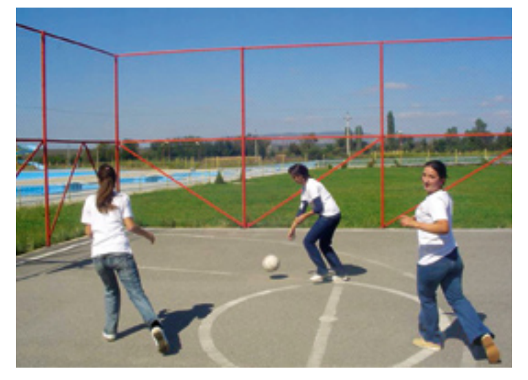
Children of DRC beneficiaries playing football with local children.

have the same network (i.e. friends, family or acquaintances) in their community as before their flight to Denmark. Most of them explain that 'the people have changed' or that all their friends are abroad. Many of them therefore find it important to stay in contact with other returnees, as they are facing similar problems and share the same history. In this regard, common activities (e.g. info meetings) could be facilitated in order to establish informal contacts and friendships. However, project activities must not create a gap between returnees and the existing local community. Return assistance programmes should therefore always