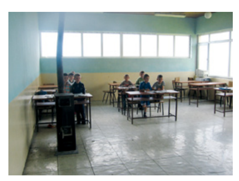
A class room in a local school in Kosovo.

As mentioned above, some children among DRC's beneficiaries also experienced difficulties getting their diplomas of schooling in Denmark accepted upon return. DRC needed to assist those beneficiaries in procuring the necessary diplomas by communicating with Red Cross camp schools in Denmark to ensure that the children were able to attend school in Kosovo and were placed at the right academic level.