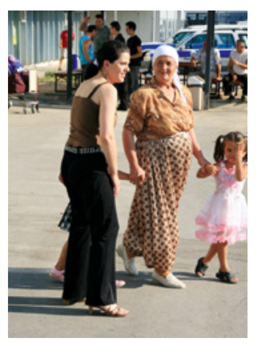
Difficult perspectives: Deported girl is welcomed by her family at Prishtina/Pristina Airport.

Though most returnees from Germany are assisted only through the REAG/GARP programme, the authorities realise that this is not sufficient. Some Länder have introduced additional programmes to promote and assist mandatory return; the BAMF database, ZIRF, offers information on countries of origin, and the rising number of conferences and meetings organised by NGOs or BAMF show that there is growing interest in return assistance on