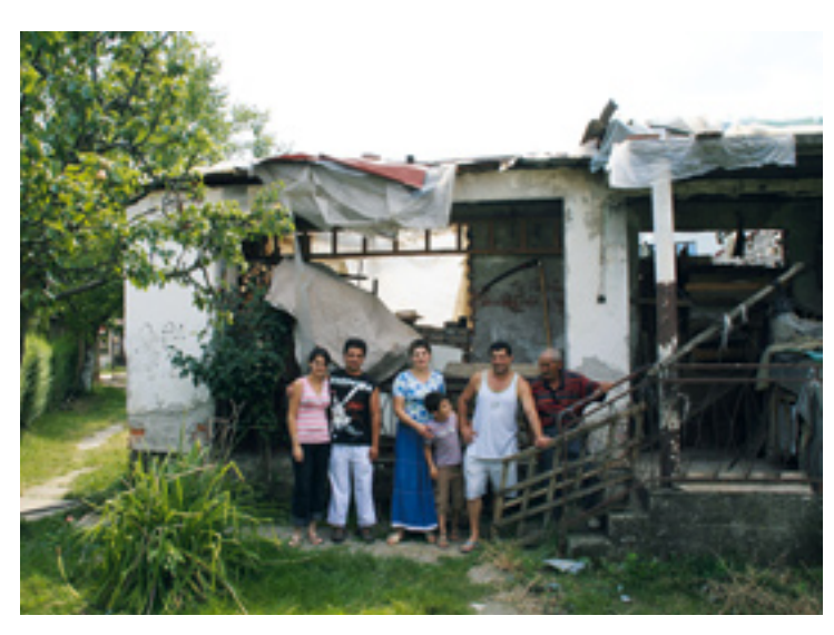
Currently, no financial support is offered for housing reconstruction to individuals/families returned from Germany.

Another important reason might be the lack of practical support offered by the field offices. If no donor covers the costs for a specific measure, the field offices' capacities to provide something exist only in theory. As these centres can offer no material support, German counselling agencies might decide that they are of no use at all for returnees.