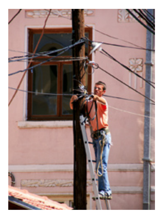
Limited options/not connected.

The Heimatgarten and DW field offices can offer substantial support to returnees only in cases where financing is secured by a German municipality or another agency. This was hardly the case when the offices were visited in summer 2007.