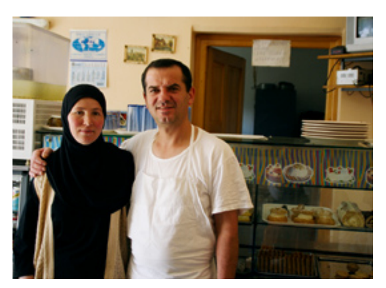
Pastry shop in the mountain village of Dragash.

The head of the family had earned some money before the flight and he still owned the house and the necessary technical equipment to run the bakery. Funding from a return assistance centre in Germany allowed him to furnish a small café, and the family could therefore continue and even improve its business.