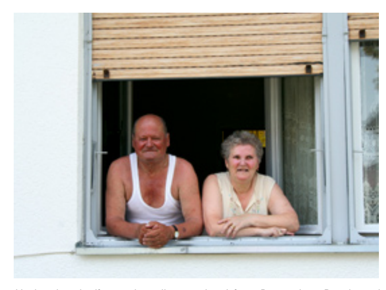
Husband and wife – voluntarily repatriated from Denmark to Bosnia and Herzegovina.

It is DRC's position, with respect to repatriation, that it is important to 1) undertake international operations in direct relation to the refugee situation in Denmark and 2) provide refugees and immigrants in Denmark wishing to repatriate with the best foundation for making a decision. Voluntary repatriation is viewed as one of three durable solutions, which include: repatriation, local integration in the host country, and resettlement in a third country. This creates a unique possibility for DRC to link its national and international work regarding return/repatriation, and DRC applies the