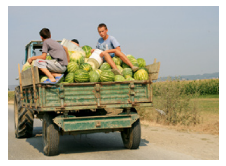
Due to poor infrastructure, agriculture in Kosovo does not pay and most food is imported at a cheaper price from neighbouring countries.

A woman who returned to Kosovo after her husband died in Germany now lives in Prishtina/Pristina with her two children who are eight and ten. The