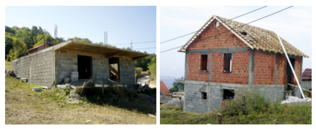
Reconstruction of house for a family of four – before and after.