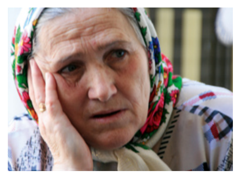
Worrying about the future: An elderly woman returned to Prizren.

Only one person interviewed who had returned voluntarily belonged to a minority group (except for the Gorani couple with the bakery shop); he was a middle-aged Roma from Prizren. He had lived for some years in Germany, where he had been married to a German woman, whom he divorced two years prior to his return. His decision to return was clearly influenced by the threat of