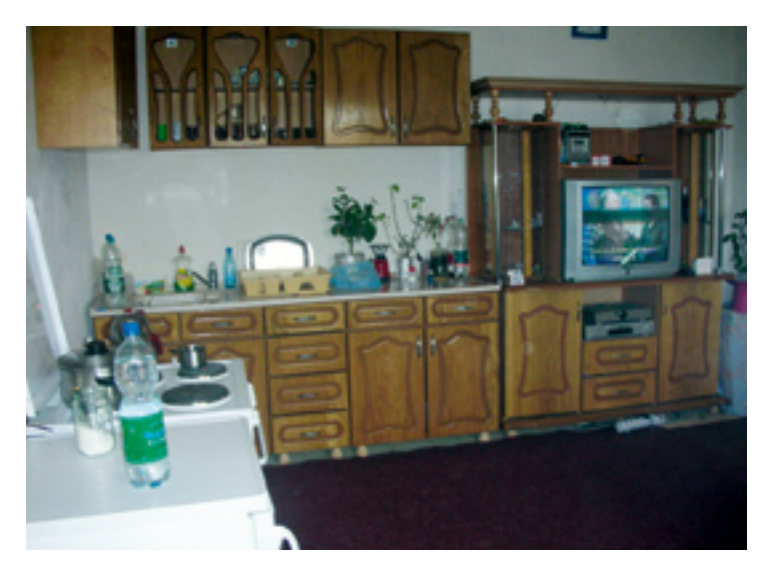
Kitchen utensils for a family of five – delivered as a part of the family's return package.

In DRC's programme for rejected asylum seekers from Kosovo, all beneficiaries are eligible for a <u>return package</u> containing fresh and dry food, furniture, kitchen utensils, fire wood, etc. The actual content of the package is based upon the needs of the individual or family, and has the value of approximately 615 Euros per person. When asking