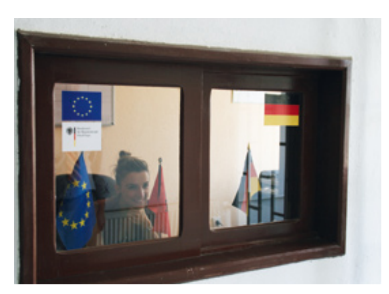
Not sustainable: The entrance of the BAMF/AWO Nürnberg field office in Mitrovica.

A much cheaper and potentially more effective method is applied by the Munich municipality office for return counselling, 'Coming Home'. A counsellor from Kosovo who lives