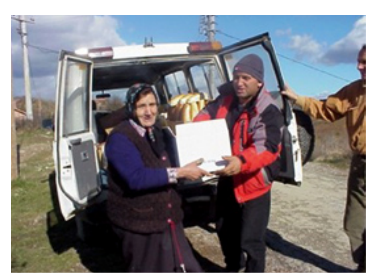
Delivering food assistance to beneficiaries.

DRC has been working in the Western Balkan region for over 13 years, providing humanitarian assistance and enabling access to durable solutions for refugees and IDPs. In particular, DRC's Kosovo programme has extensive experience in supporting vulnerable returns, IDPs and minority communities. Since 2003, DRC Kosovo has assisted over 750 displaced minority families to return from displacement in Montenegro, Macedonia and Serbia,