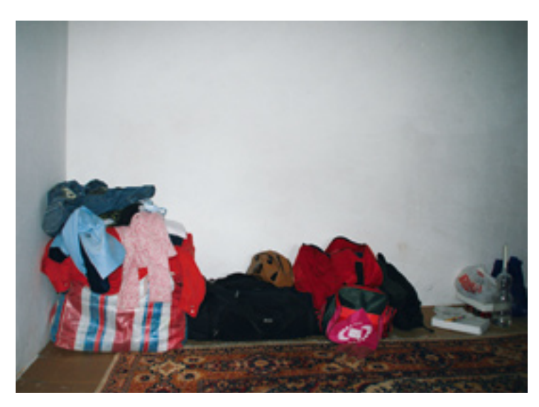
Forcefully returned persons often cannot bring much luggage with them during the return.

The comparison with forcefully returned persons revealed one important insight. While there is often not much difference regarding the assistance returnees receive, voluntarily returned persons are, generally speaking, in a better mental condition. Months after deportation forcefully returned families are often still in some state of shock and are unable to manage essential parts of their everyday life in Kosovo. It therefore appears that allowing returnees even a short period of time to prepare for return and consent to mandatory return gives them the chance to accept