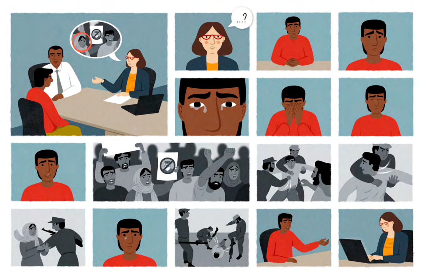
You may be asked to give very detailed explanations about your experiences. Some of your experiences may be very difficult to talk about. Take your time and ask for a break if needed.