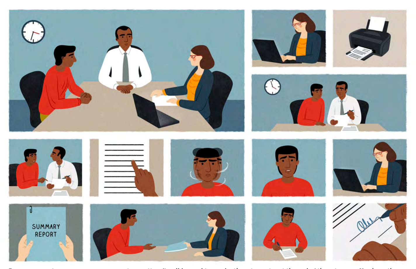
During your interview a summary report is written. It will be read to you by the interpreter at the end of the interview. You have the opportunity to correct errors in the summary report.