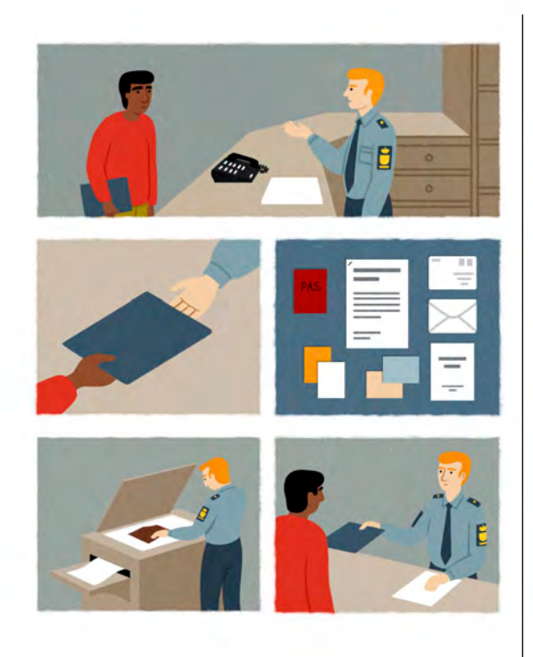
If you hand in personal documents to the Danish authorities, make sure to get your own copy of the documents.