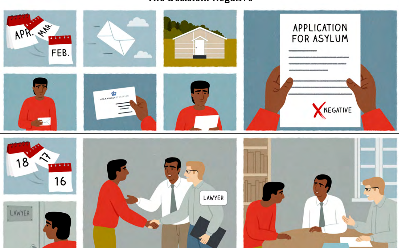
If the Immigration Service rejects your application for asylum it will automatically be appealed to the Refugee Appeals Board. An independent lawyer will be appointed to help you during the appeal proceedings. You will attend a meeting with your lawyer prior to the Board hearing.