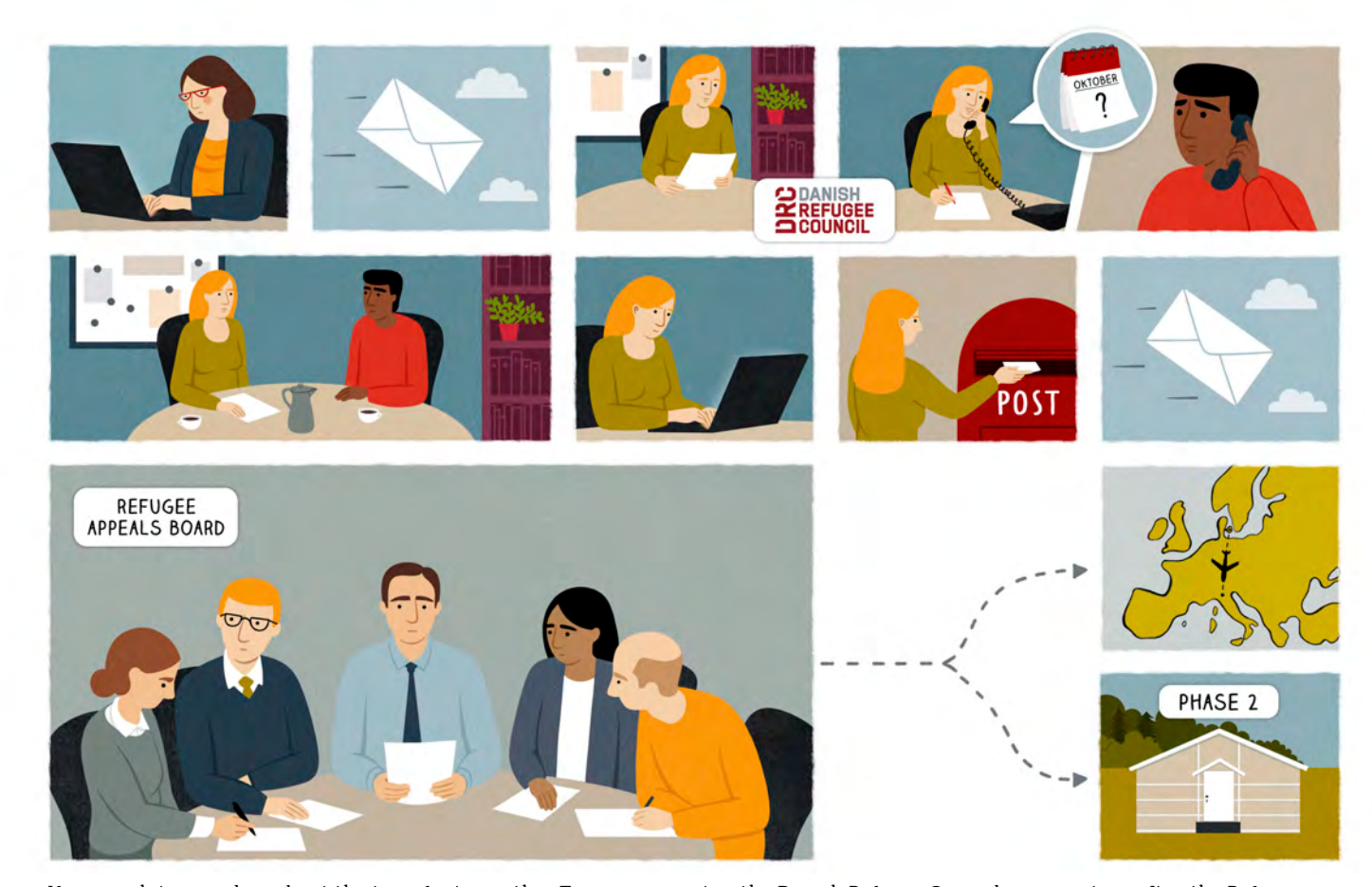
If you wish to complain about the transfer to another European country, the Danish Refugee Council can assist you. It is the Refugee Appeals Board that makes the final decision.