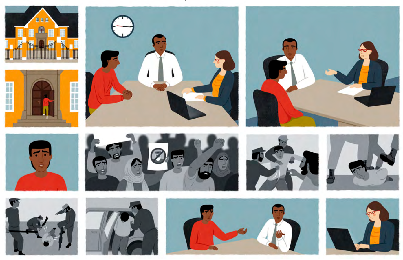
During the asylum interview with the Immigration Service you will be interviewed in detail about why you fled your home country. The case worker at the Immigration Service will write a summary report of what you say.