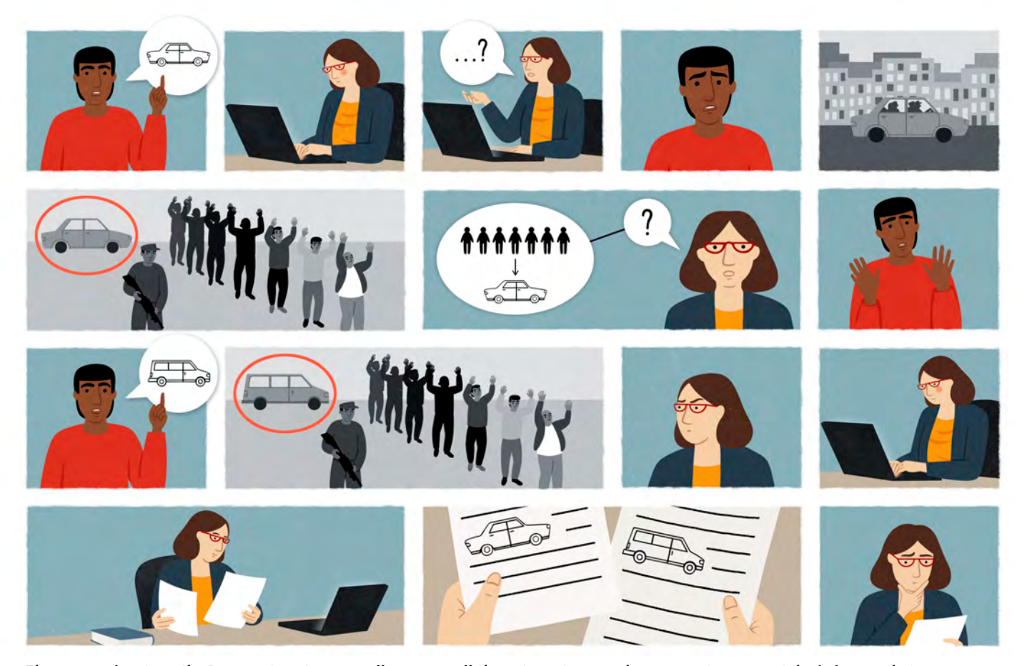
The caseworker from the Immigration Service will compare all the information you have given to assess if she believes what you say. Answer the questions as honestly as possible. If you do not know the answer to the questions it is okay to say 'I don't know' or 'I am not sure but I think...'