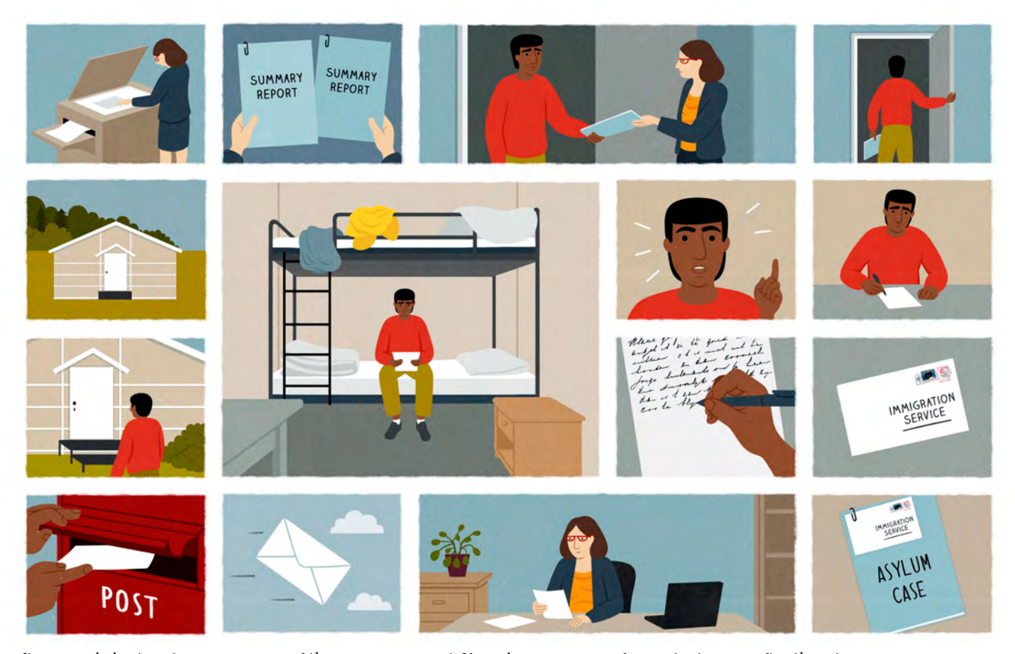
It is a good idea to get your own copy of the summary report. If you become aware of important errors after the interview you can always write a letter to the Immigration Service. You can write the letter in your own language.