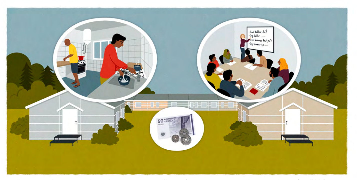
During your stay in your asylum center you may be offered basic schooling and you can cook your own food in shared kitchens.