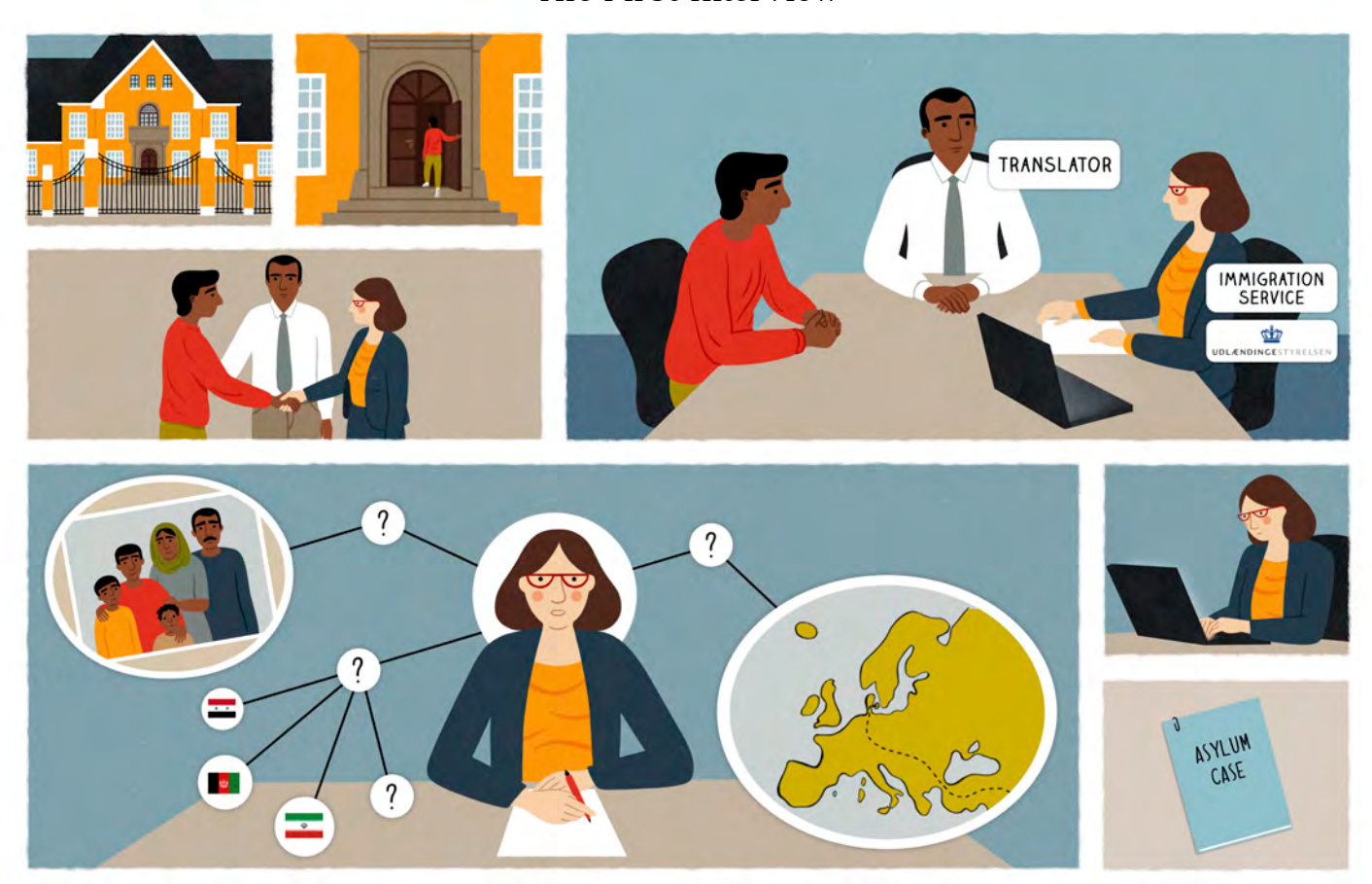
During the first interview with the Immigration Service you may expect to be asked questions about your identity and nationality, your family and travel route. You may also be interviewed briefly about why you fled your home country.