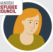
Danish Refugee Council